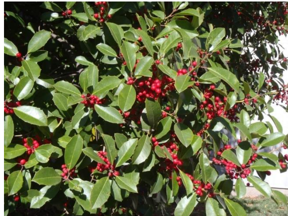
American Holly (“Greenleaf” Fruit and Leaves)

Two American holly ( Ilex opaca ) individuals are located along the Project area southwest of Southampton Substation and east of David Whites Lane. American holly trees are exploitably vulnerable under Part 6 NYCRR 193.3d. The American holly is a broadleaf evergreen with prickly green leaves measuring one to three inches in length and width. 20 Greenish-white flowers bloom from April to June, followed by bright red or orange drupes on female trees from September through February. Its smooth bark ranges in color from light brown and gray to white, and is occasionally reddish.